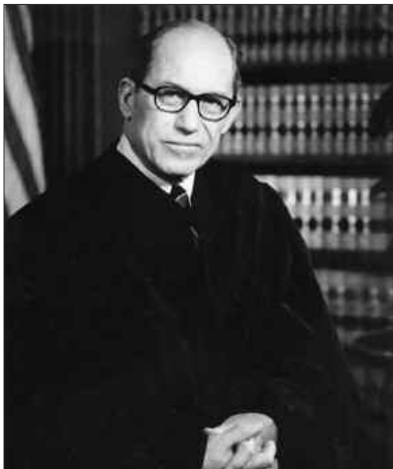
Byron White, who went on to become a U.S. Supreme Court Justice, still owns two of CU's longest play records.